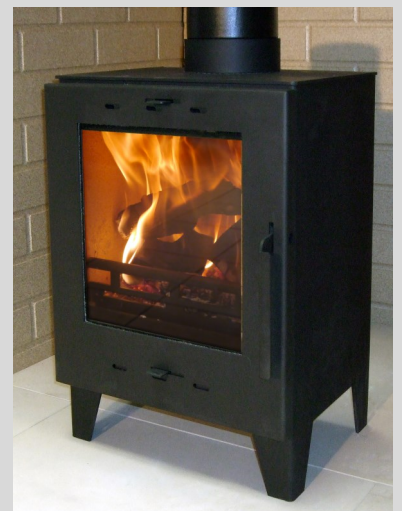
Eco 30 Stove with Legs

The Eco 30 is available with built in legs and as a convector stove option. Chrome handle is fitted as standard with black handle and knobs available to order as options.