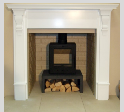
Eco 30 Compact on log store