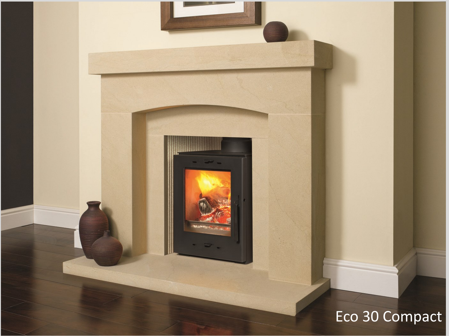
Eco 30 Compact