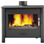
Optional Black pillars

T he ESSE 125 and 225 have all the benefits of the ESSE 100 and 200 but with a contemporary twist. This design offers impressive efficiency levels of over 80% and comforting nominal heat outputs of 5 and 7.6kW respectively. The 125 and 225 are steel bodied with cast door and stainless steel pillars. An optional ‘all black’ finish is available. ESSE 125 and 225 have a twin position grate which is ideal for burning both wood and clean burning approved mineral fuel. Simple top and bottom air controls make for easy and efficient operation.