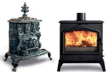
1854's ESSE 'Fame'