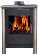
Optional Stainless Steel pillars

A contemporary stove with a 5kW nominal heat output, ESSE 525 is ideally suited to sit in a fireplace chamber or builders opening. The spectacular and uncluttered view of the flames is elegantly framed by stainless steel columns and can be easily controlled by beautifully engineered air controls. Its small footprint and moderate output make it easy to plan into a modern living space without overpowering a centrally heated room. A twin position grate allows for both wood and clean burning approved mineral fuel.