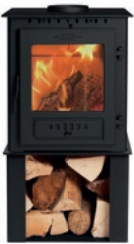
With Log Store

According to Aesop, ‘good things come in small packages’. This adage is certainly true when it comes to the ESSE 1. It is far from basic and as you would expect from an ESSE it is packed with small details including flue draft test point, levelling adjustment so it can sit on a slightly uneven hearth and it is Ecodesign ready. There is even a multi-fuel version for all who desire the capability of burning an approved clean burning mineral fuel.